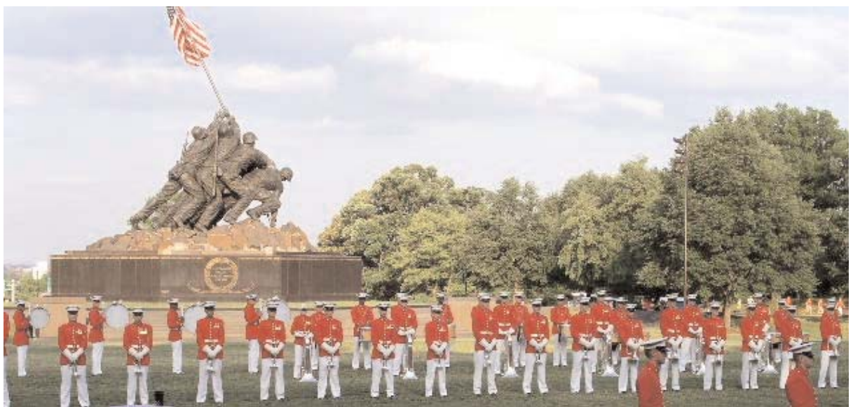
First Sunset Parade of the 2007 season at the Marine Memorial adjacent to Arlington National Cemetery, Washington, D.C. June 5th, 2007.

Our next Meeting is 0900 hrs Saturday June 16th , 2007 at the Trenton Town Hall. Located at 1071 State Hwy 33 East, West Bend Wi 53095.