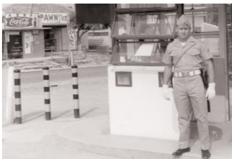
Left; Guard duty Camp Mactouris, Okinawa