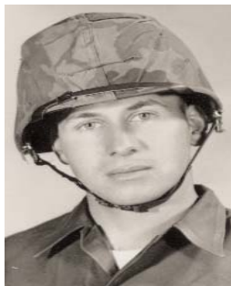
Left; Gung Ho Marine!