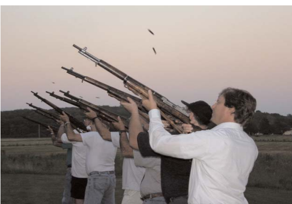
Live fire during Honor Guard practice Aug 21st 2006 - note the ejected shell casings.