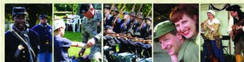
CENTRETRY-BY-LANTERN TOURS / POSITIVELY PATRIOTIC PARADE / ENTERTAINMENT / VETERAN BENEFIT INFO / BUILDING TOURS / CHILDREN'S ACTIVITIES & MORE!